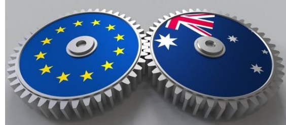
Now manufacturing in Europe and Australia

We have been lucky in Australia to be well protected from the mass infections seen in other regions, and very strict border controls have made this possible. However, regulated shutdowns in other countries where we make and source componentry has seen a severe effect on our production capacity, coupled with a global shortage of capacity in logistics, has resulted in major delays in product shipping.